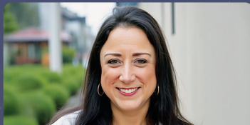
Guiding Grace (Thrive)