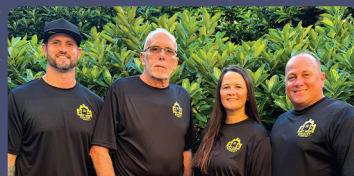
Fort Hope Ministry of SWFL Inc.