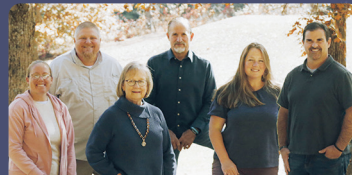
Whisper Mountain Youth Camp