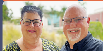
Reciporical Ministries Intl.