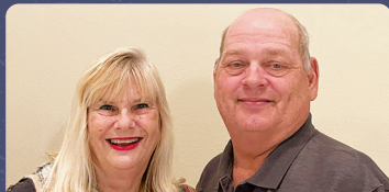
The Rachel Project