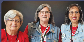
Operation Christmas Child