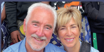
African Vision of Hope

Join us in prayer as we intercede for these missionaries by lifting up their personal needs and undergirding the work of the Gospel. Thank you for taking the time on a consistent basis to pray for our missionaries.