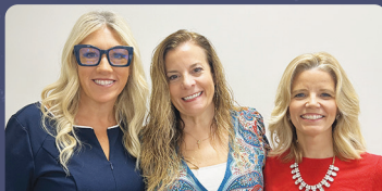
Pregnancy Center of SWFL