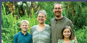
Ends of The Earth Adventures