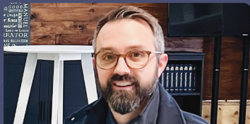
Practical Missions Cohort