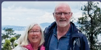
Word of Life Intl. Bible Institutes