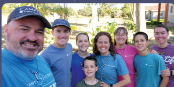
Family Legacy Missions Intl.