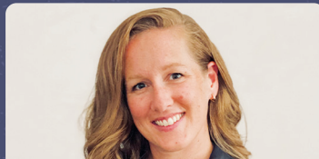
Verity Pregnancy Center